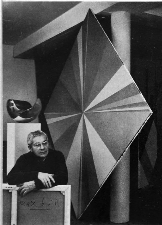
MAX BILL IN HIS STUDIO AT ZUMIKON-ZURICH Informed by a grave, clear singularity.

and made better by all-embracing design systems—now seems to have been a heroic illusion, an ignis fatuus of avant-garde thought: no one really becomes less wicked or more rational by living in an International Style building.